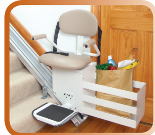
Optional Grocery Basket