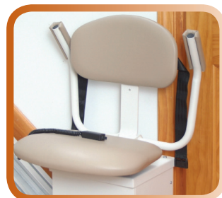
Optional Flip-Up Arms